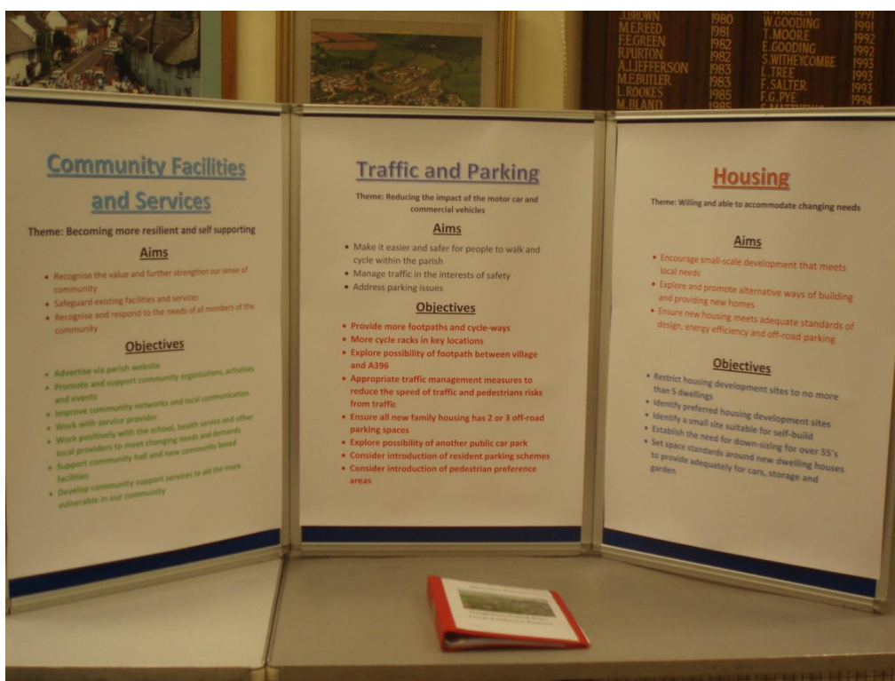
Presenting the themes at a consultation event

Neighbourhood Planning Regulations 2012 (Part 5 s15)