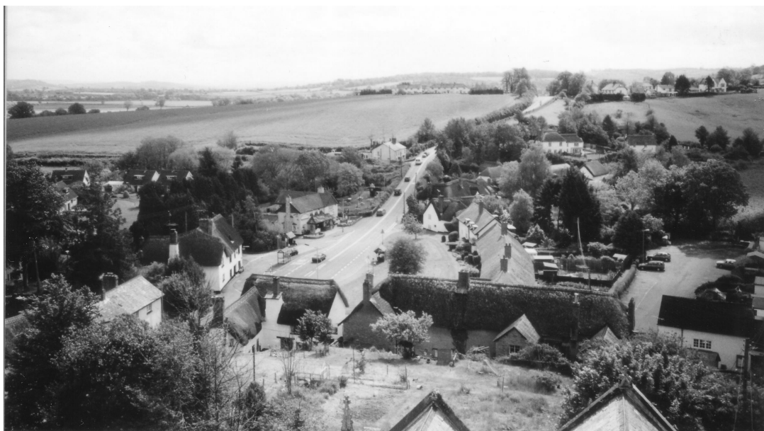
View of Newton St Cyres from Church tower