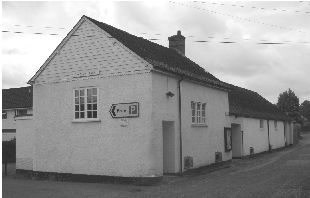
Newton St Cyres Parish Hall