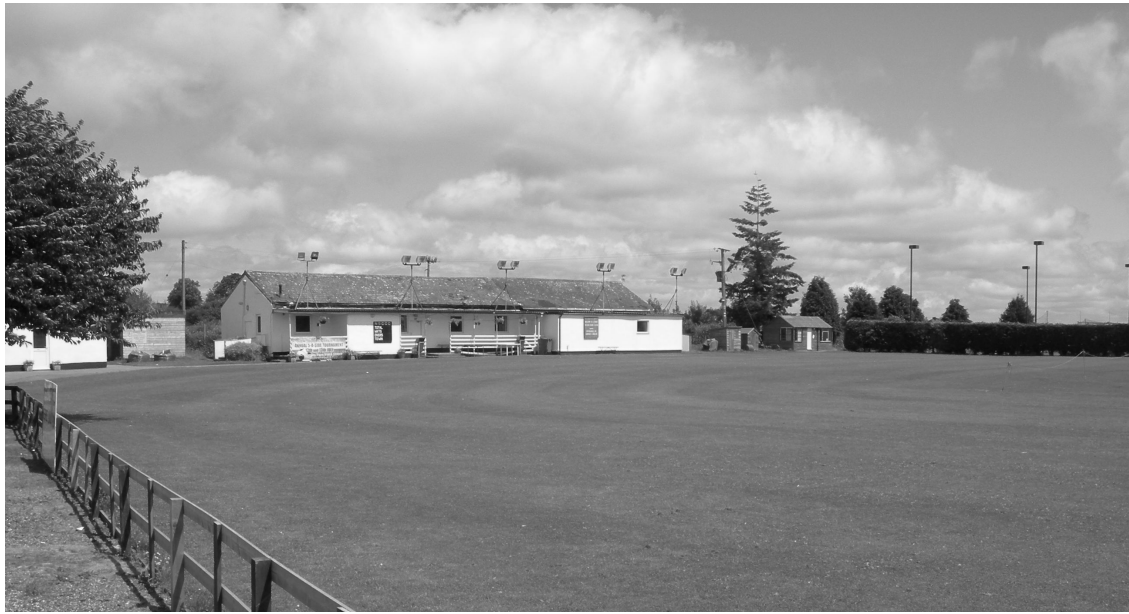
Newton St Cyres Recreation Club

Social events are organised from time to time in the Parish Hall and the Recreation Ground and by various village organisations. The Newton Village Revels are held every two years and involve all village organisations.