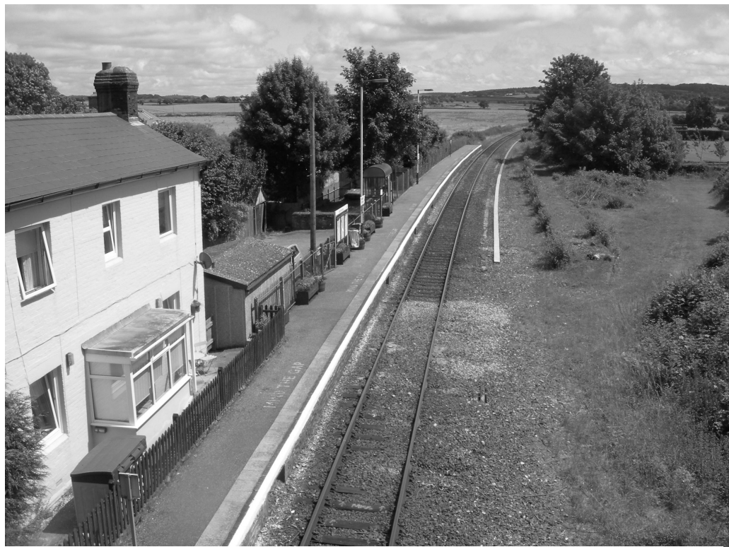
Newton St Cyres station