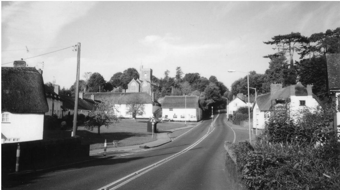
Newton St Cyres Village centre

Consideration should be given as to whether the village sees itself as a traditional country village, providing facilities and events just for the village and its near neighbours, or as a centre of excellence attracting the wider community (Football)